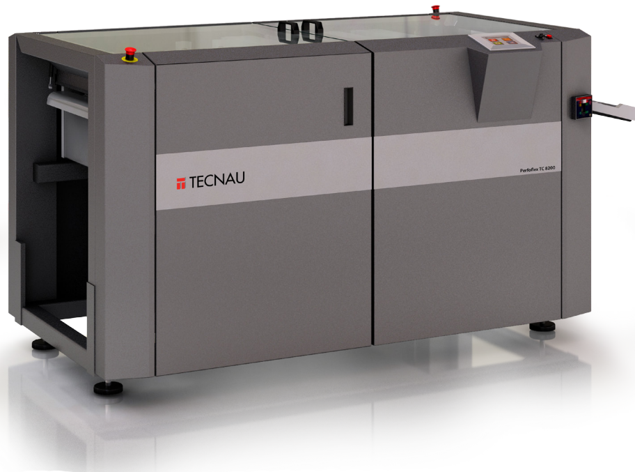
The PERFOFLEX TC 8200 Dynamic Perforator